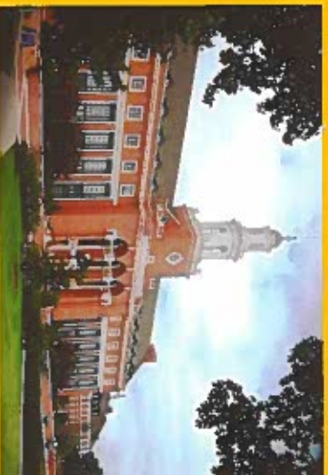
Oklahoma State University