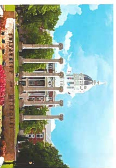
University of Missouri-Columbia

Free Workshops, Free Brokerage Accounts, and Free Study Abroad provide recipients with a practical understanding of important life skills not typically covered in the school curriculum. Hagan Scholars have attended 514 colleges and universities located in 48 states.